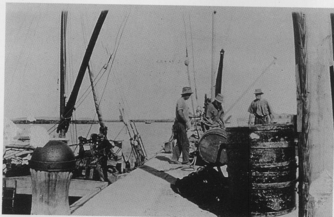
Unloading beer from a lighter at Cossack's jetty. The cargo ketch 'Battler' about to depart from Cossack. The lighter 'Nicol Bay' which brought cargo from ships anchored about eight kilometres away. The abandoned Customs House.